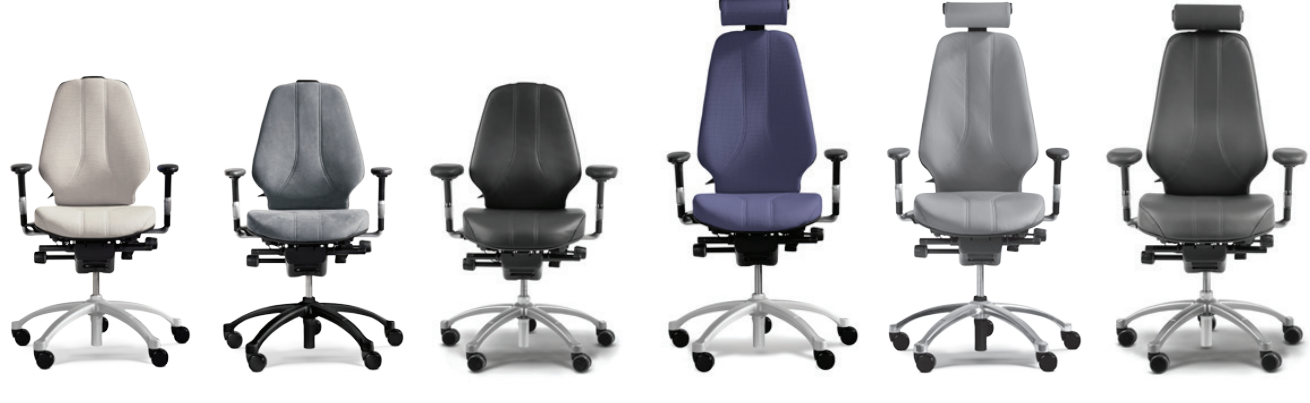
RH LOGIC 300